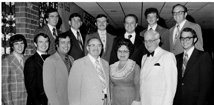
The first graduating class of AGTS, June 27, 1974.